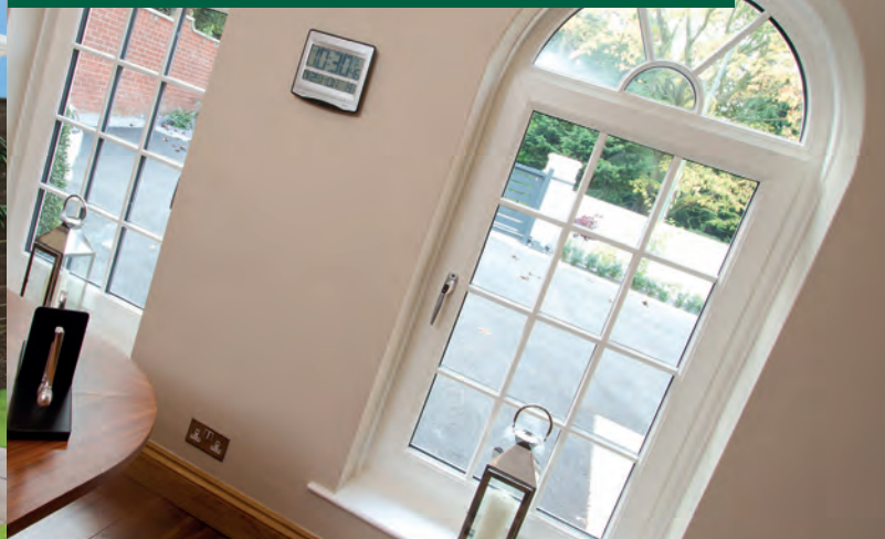
TILT AND TURN WINDOWS