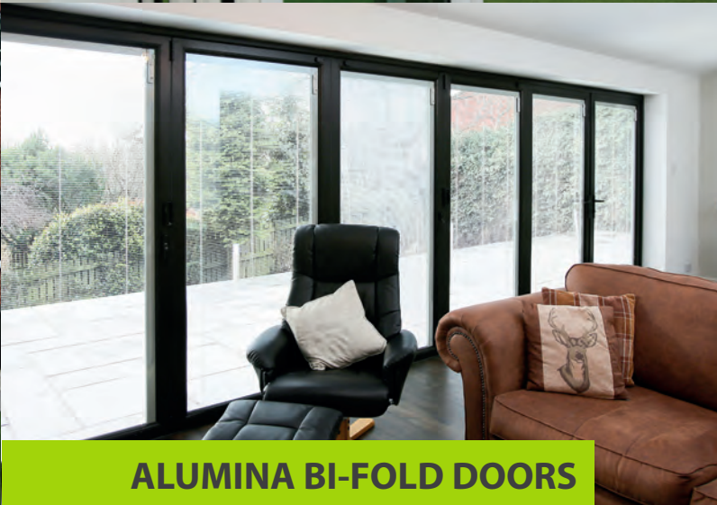
ALUMINA BI-FOLD DOORS