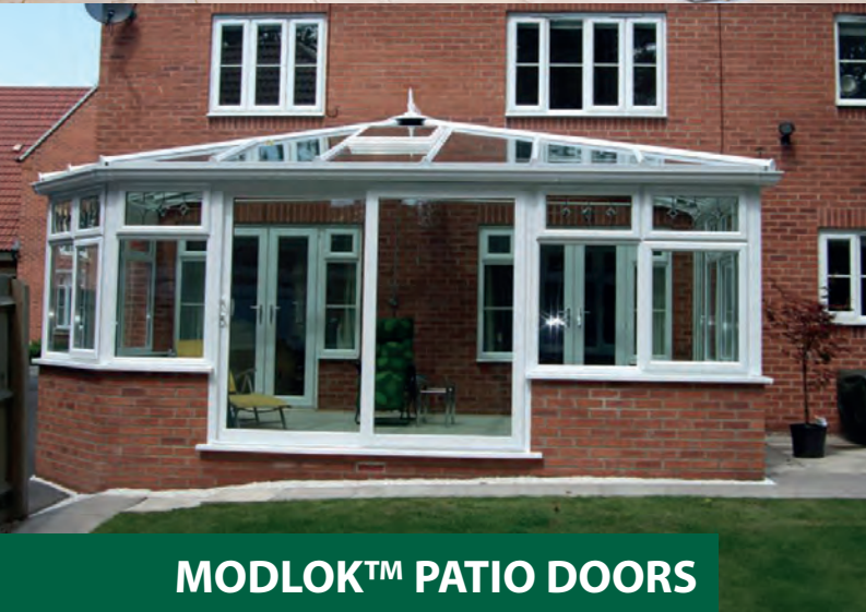
MODLOK™ PATIO DOORS