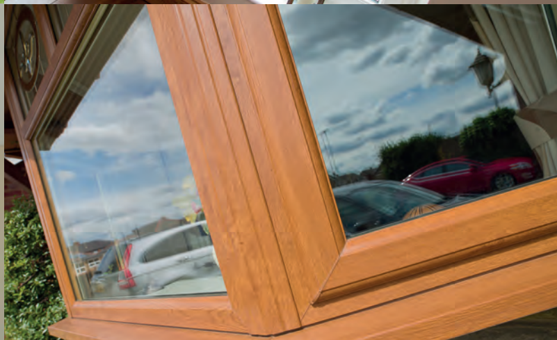
BOW AND BAY WINDOWS